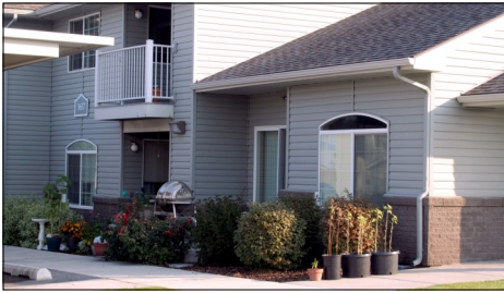
TWO BEDROOM/ONE BATH 800 SQFT